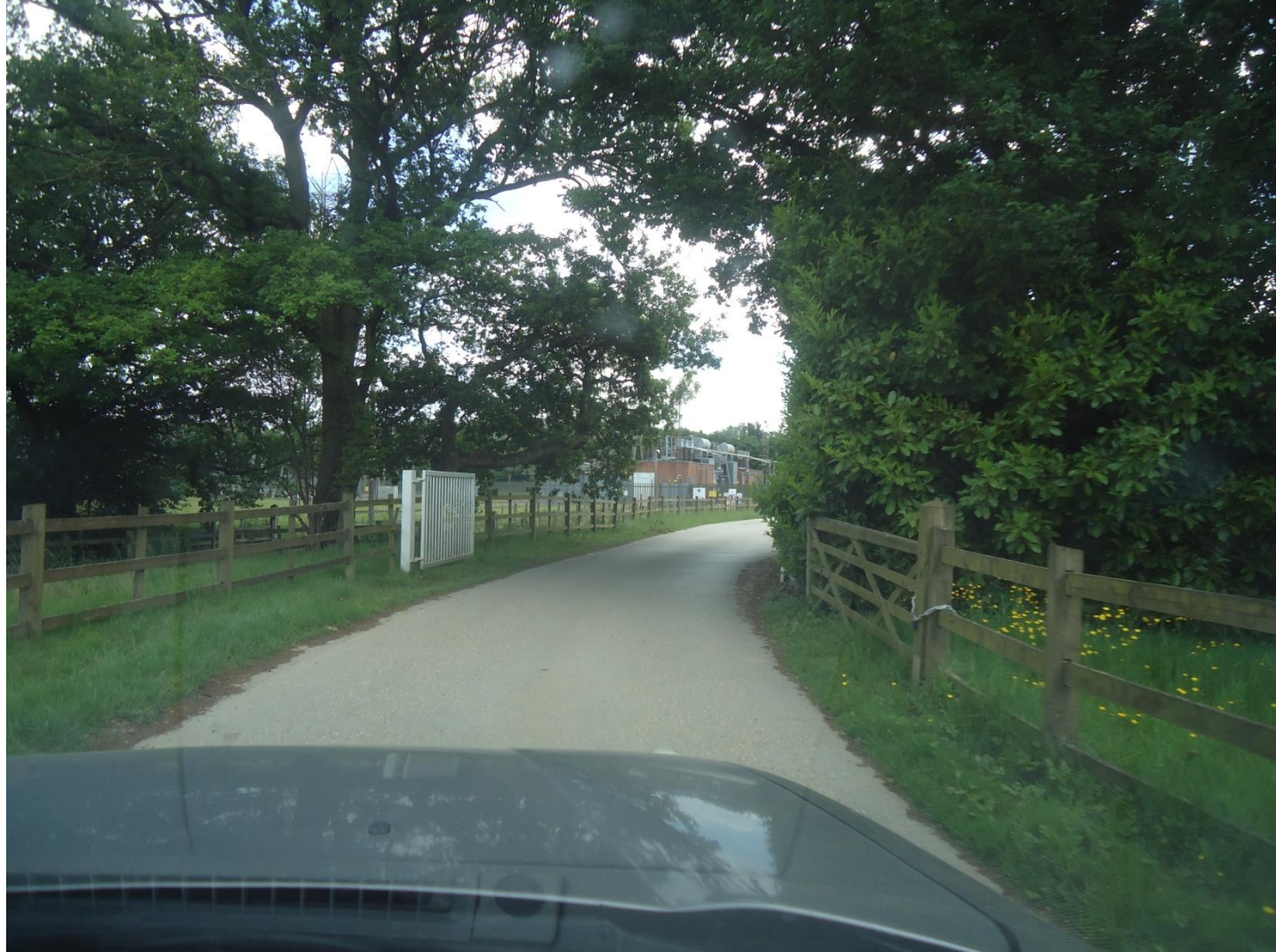
Figure 1 : Site Entrance off Byfleet Road